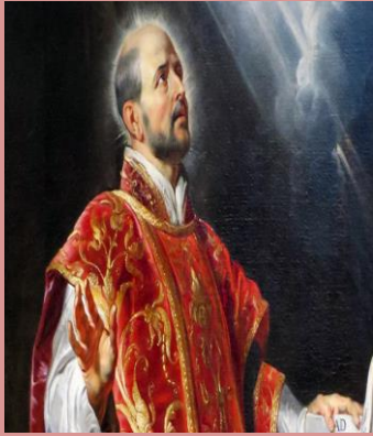
St. Ignatius of Loyola